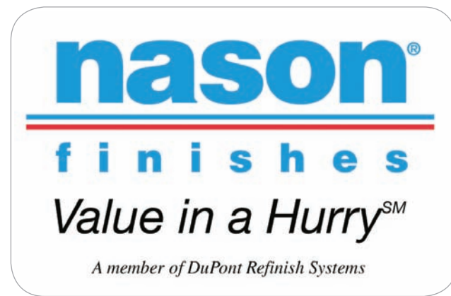
DN72 – 3' x 2'