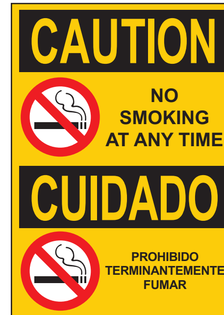
No Smoking N10 – 7" x 10" Aluminum