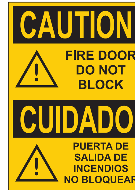
Fire Exit N14 – 7" x 10" Aluminum