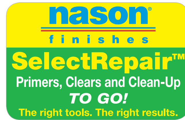
DN73 – 3' x 2'