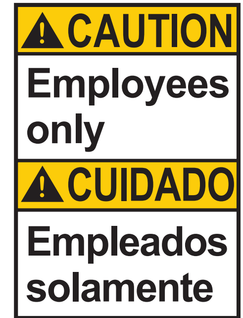
Employees Only N16 – 7" x 10" Aluminum