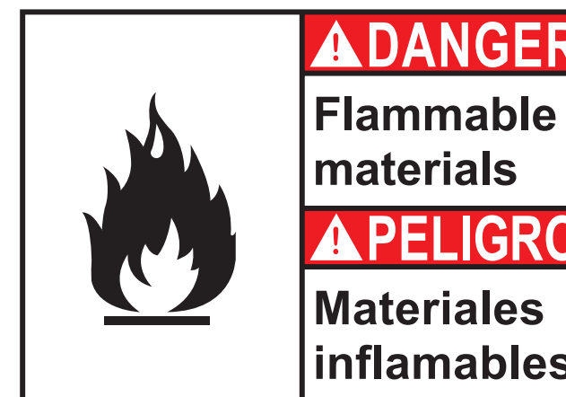
Flammable Materials N12 – 10" x 7" Aluminum

phone 888.790.3216 fax 313.895.4444 email nason@iawonline.com visit www.dupont.iawonline.com