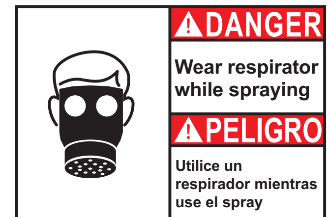
Wear Your Respirator N18 – 10" x 7" Aluminum

*order individual signs or order them as a complete set of 5